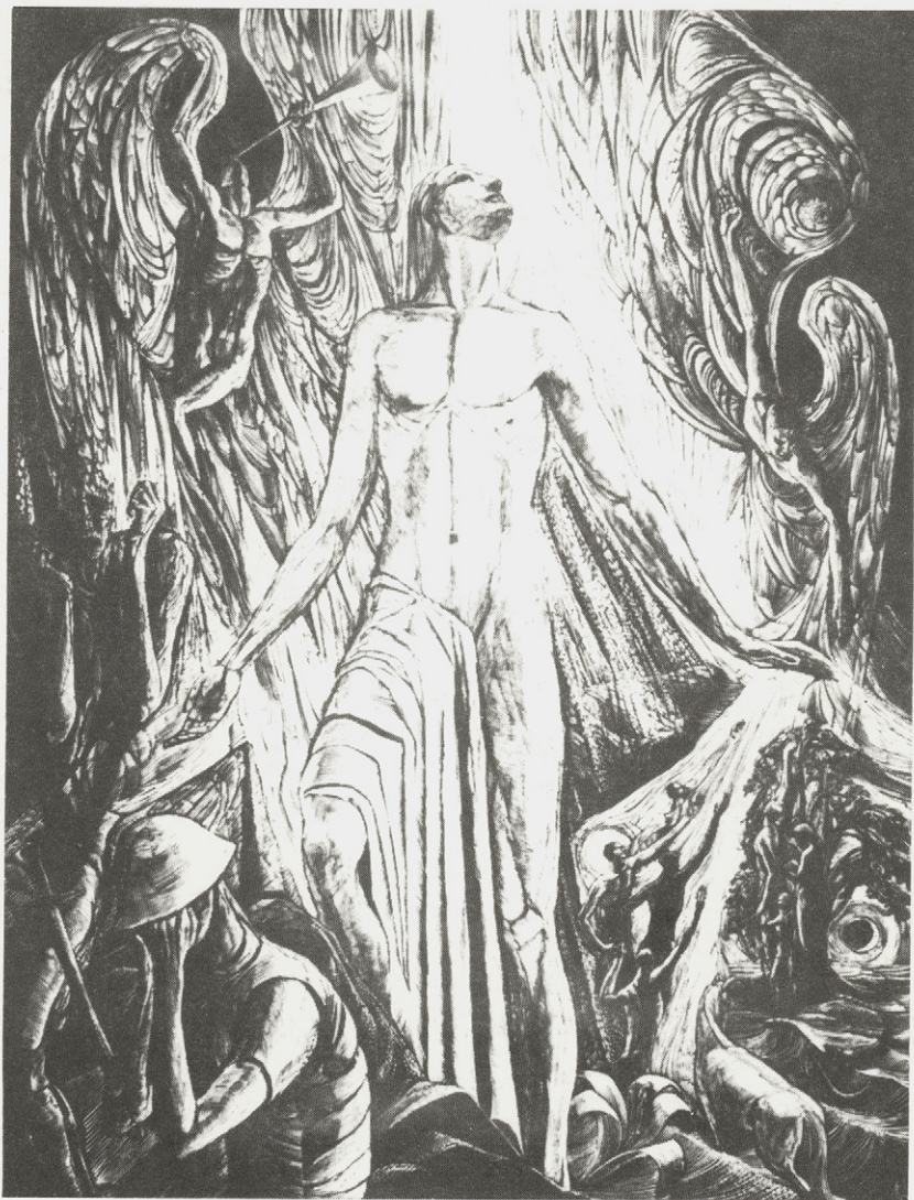
Rosemary Kilbourn wood engraving on paper